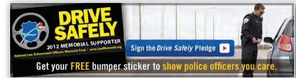
Promoting Officer Safety

The Memorial Fund also conducts a variety of events each year to honor those law enforcement officers who have made the ultimate sacrifice. A principal organizer of the National Police Week observance each May, the Memorial hosts over 20,000 people at the Candlelight Vigil held annually on May 13th to honor all law enforcement officers.