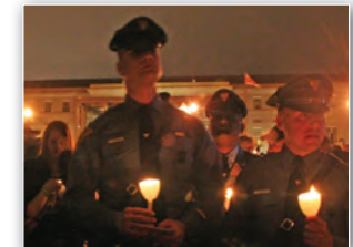
Honoring the Sacrifice