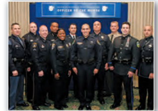
Commemorating the Service.